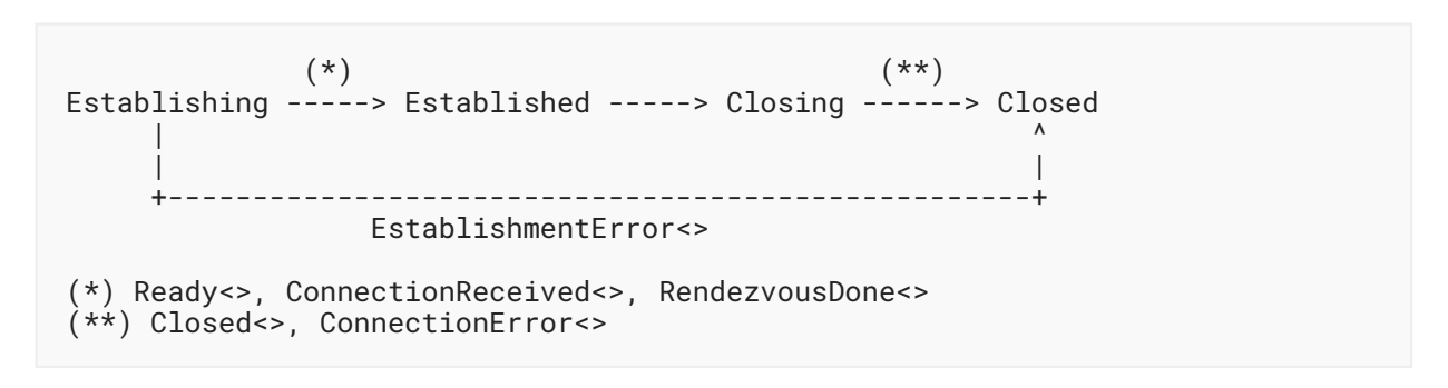
Figure 2: Connection State Diagram

The Transport Services API provides the following guarantees about the ordering of operations: